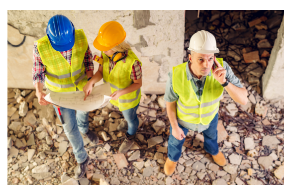
Fact - In 2015, 72% of all reported utility damages occurred because someone failed to call "Miss Utility".

It's so simple - either go on-line to www.missutility.net or call 811 before you start your project. That way you are assured of knowing what lies below.