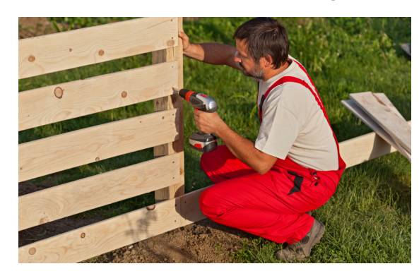
Fact - Over 200,000 damages occur to underground facilities by the construction industry in the United States each year.